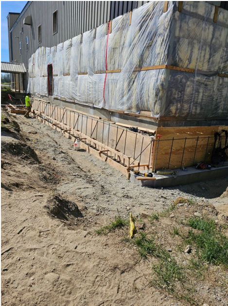
Left: Foundation footing