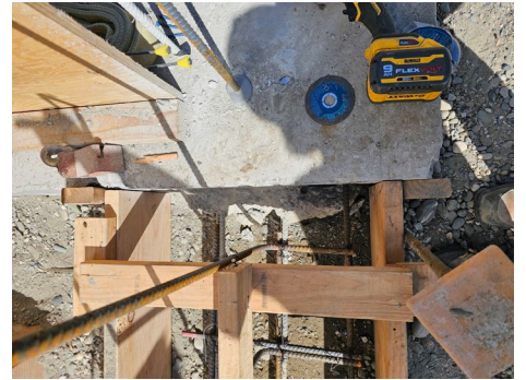
Right: Previously placed concrete footing, doweled Boding agent and concrete brought to SSD before placement